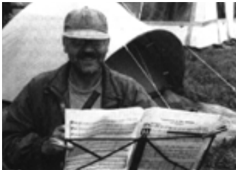
Kids, camping, tuning at Huismuziek Workshops see story, page 5

contact: Ms Clara Legêne p/a bureau LOAM Kiezerstraat 3 3512 EA Utrecht, Netherlands +30 2302301 +30 2300280 loam@knoware.nl