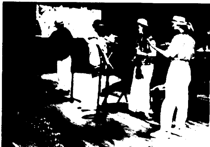
Playing in Costume at CAMMAC, Lake MacDonald, Quebec